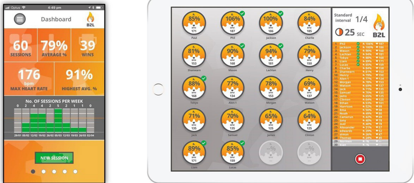
Figure 2 Snapshot of Burn 2 Learn (B2L) smartphone application dashboard and group session.